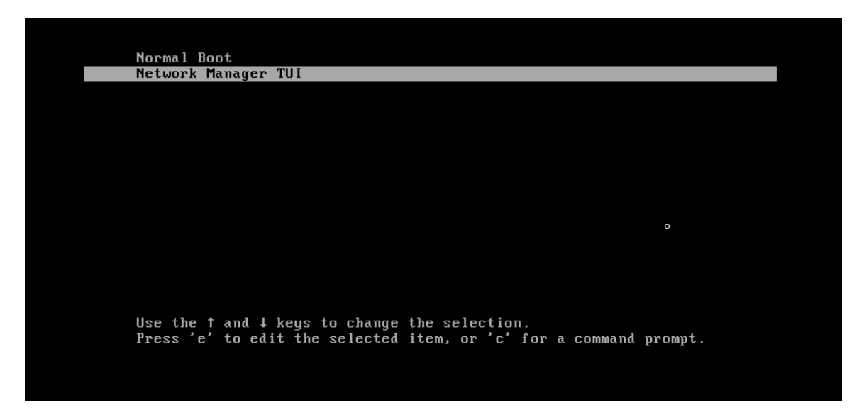
FIGURE 4 Console

Select Network Manager TUI to the set the static IP address, and Normal Boot to start SCI.